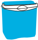
STANDARD RIGID COOLER